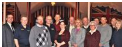
Above, attendees pose in the beautiful & historical McKay Avenue School

EFCL reps were pleased to discover in a meeting on Wednesday that Education Minister Thomas Lukaszuk is a big supporter of sharing school space with community leagues. In fact, reviewing the space needs of the community, including community leagues, needs to be done before any more new schools are built, according to the Minister. Other topics discussed included the promotion of neighborhood schools, the revitalization of older neighborhoods and the federation's 100th Anniversary project in Hawrelak Park.