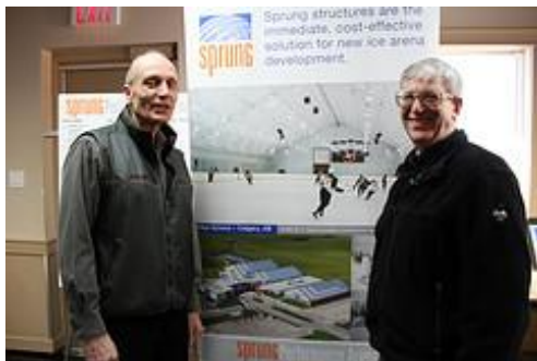
Presentation by GRES consortium on covered rinks, geothermal heating and cooling systems, LED lighting

The idea of building a roof over the outdoor skating rink continues to intrigue many community league members. Approximately two dozen league reps turned out on February 11 to hear a proposal from Sprung Structures Ltd., which said its stretched membrane cover and energy-efficient lighting system would cost anywhere from $600,000 - $900,000 to install, depending on the size of the rink. The EFCL believes the concept has good potential and is looking for ways to get the cost down. Discussions on that front continue with Sprung and the federation welcomes suggestions from members, including the names of any other suppliers that can do this work.